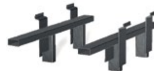
3000358 / 3000359

ART. NO. SPECIFICATION 3000358 Right 3000359 Left